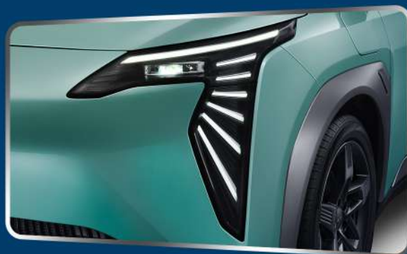
Angel's Wing Headlights