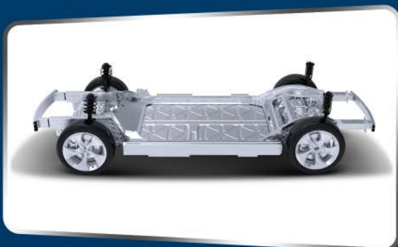
100% Pure EV Platform