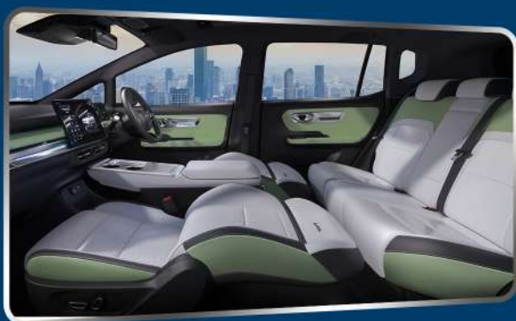
Reclining Seat (1.8 m Super King Size Bed)